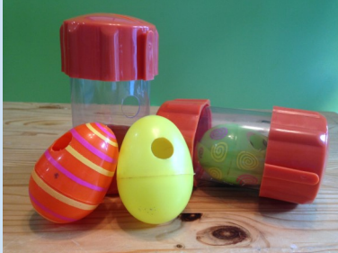
Some examples of rolling food puzzles.

Food puzzles are an excellent way to increase your cat's activity and mental health by giving them a new, more natural way to get their food by "hunting" for it. Food puzzles typically come in two styles, rolling and stationary. They can be purchased or homemade, and can be used with dry or wet food, or treats.